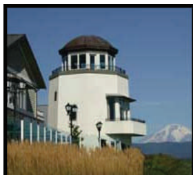
Harborside Bistro in the Hotel Bellwether on the Bay

ASWA is the home for all women accounting professionals whether new to the field, experienced or considering a career transition.